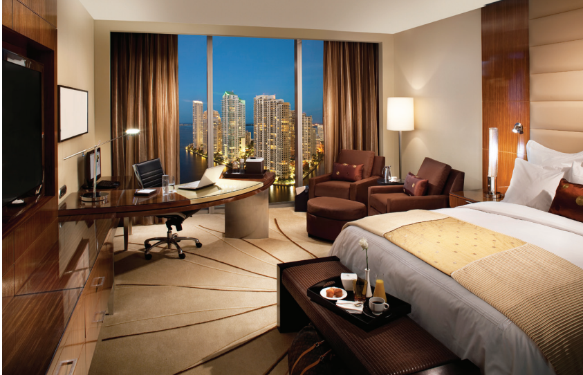
Best Western International